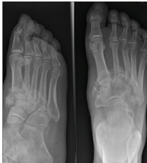
Figure 2. X-ray examination showing acute CN in the patients mid-foot.

palpated are very strong and often 'bounding'. Ankle pressures are frequently abnormally high, demonstrating the presence of medial wall calcification, which is a common feature of CV (Sharma et al, 2010).