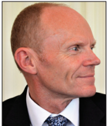
Author: Neil Baker

Diabetic Charcot neuroarthropathy (CN) is an uncommon foot complication but it needs to be recognised and managed as early as possible to help prevent gross deformity. In its acute stage, it is typically characterised as being red/pink, swollen, very warm, and may have some deformity and possibly some pain. However, one of the overarching features of all CN is a loss of sensation and evidence of autonomic nerve dysfunction. The case is unusual because although the clinical features of an acute CN were present, the bedside tests commonly used for determining sensory neuropathy were absent. When further laboratory neurological function tests were performed, small and large fibre neuropathy was evident. This highlights the need for clinical vigilance when diagnosing acute CN.