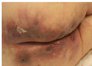
Picture 3: First consultation after therapy refractory medical therapy in 2014