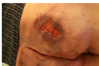
Picture 4: 6 weeks later with increasing wound area and inflamed tissue