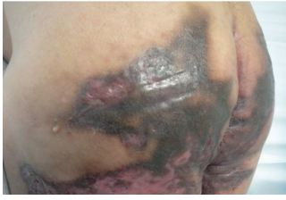
Picture 1: Painful inflammatory lesions in an active working male patient