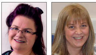
Authors: Emily Haesler and Karen Ousey

In 2016, the International Wound Infection Institute reviewed the wound infection continuum through a literature review and formal Delphi process. This article discusses some significant changes made to the wound infection continuum, including changes in terminology used to describe phases of wound infection, and distinction between early (covert) signs of local infection and the overt classic Celsian signs. Clinical indicators of potential biofilm in a wound, which were agreed on by experts as part of the Delphi process, are explored. An overview of strategies to manage local wound infection, and the important role of antiseptics in providing an option for early action against microbial proliferation, are also presented.